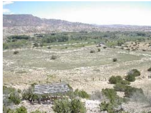
Poshuouinge overview – scanning one's eye over the area, the huge site can be visualized with its remaining wall outlines and plaza features.

Poshuouinge, a very large public site, is directly above the Chama River with fertile fields - now modern farms - spread out below the site. Poshuouinge, which means “village above the muddy river”, was occupied from AD 1400 to 1500. Tewa Indians claim the site as one of their ancestral homes.