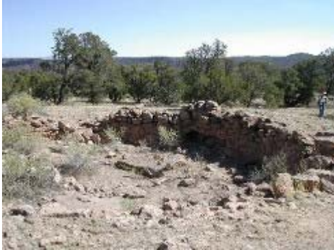
One of the many room blocks still visible at Tsi-P'in.

Portions of the site have been stabilized; numerous low walls outlining room blocks are visible. The northern portion of the site contains cavates with evidence of construction of room blocks in front of the openings in the tuff. A well defined reservoir indicates that farming on the mesa top helped to sustain the large village.