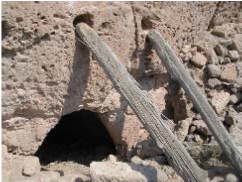
Timbers remain inserted into holes in the tuff where room blocks once stood in front of cavates at Tsi-P'in.

Ku-ouinge or "stone pueblo ruin" is a smaller contemporary site from the late prehistoric period, around A.D. 1350 to 1550. It is estimated that there were a total of 560 rooms. The site has never been professionally excavated, and has been subjected to vandalism over a long period of time including several times since site stewards have been monitoring the area. In a more secluded area of the Forest, "Ku" is extremely vulnerable to visitors on ATV's and on foot.