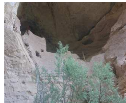
Balcony at Nogales Cliff House

The Nogales Cliff House complex consists of 11 rooms or houses and at least 20 cists in three different levels. Two houses, located in a balcony above the complex are hidden behind a high jacal wall with some of the structural timbers showing through. Eight houses con-