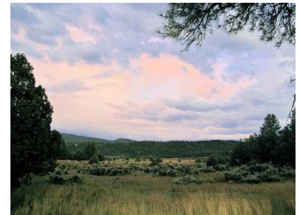
Sunset in the Gallina Highlands