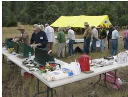
Saturday's lunch line.