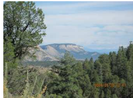
Uplifted strata of the Gallina highlands