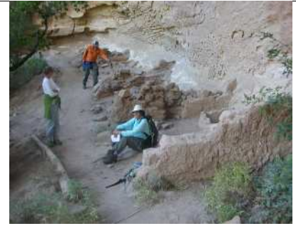
Houses at the base of the talus slope, Nogales Cliff House. (Lee and Candie Borduin, Elaine Gorham, left) Paul Jones

form to the natural contour of the talus slope upon which they rest. The balcony is not believed to be a second story to the village. One house clings precariously on a ledge to the left above the main village. Upon excavation, all of the structures were found to have typical Gallina features inside each room including fire pits, deflectors, ventilator shafts, and storage bins located in the southern end of each house.