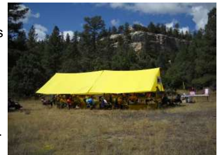
The Chuapera Camp Meeting

Details about each speaker will be forthcoming. All meetings begin at 6 pm, and are held in the new beautiful Forest Service office at 11 Forest Lane, approximately six miles southwest of Santa Fe south of the intersection of NM 14 and NM 599. Come at 5:30 with your brown bag supper, and enjoy socializing with stew-