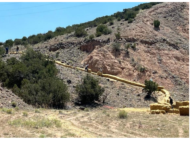
Some of the 400 straw bales on the way!