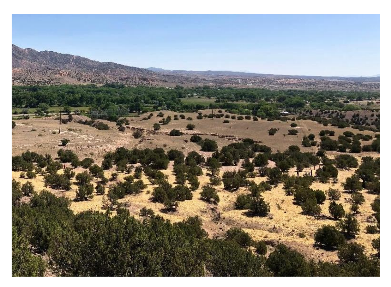
Results of the Poshuouinge seeding project (seed covered with straw is in the foreground). See the story on page 4.