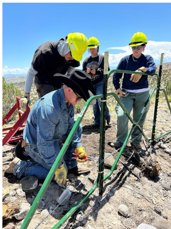
Fence construction with YCC crew and SFNF Planning staff. Taken June 11, 2025.

We accomplished so much with the help of many. Stay tuned for further implementation activities in Fiscal Year 2026!